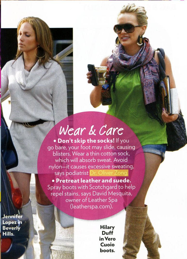
Jennifer Lopez in Beverly Hills.