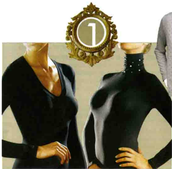
SEAMLESS MICROFIBRE TOPS FROM OROBLU

The emphasis for fashion this season is on wearability and functionality – real clothes for real women with real lifestyles. Fashion is about fun - when you're bored with fashion you're bored with life.