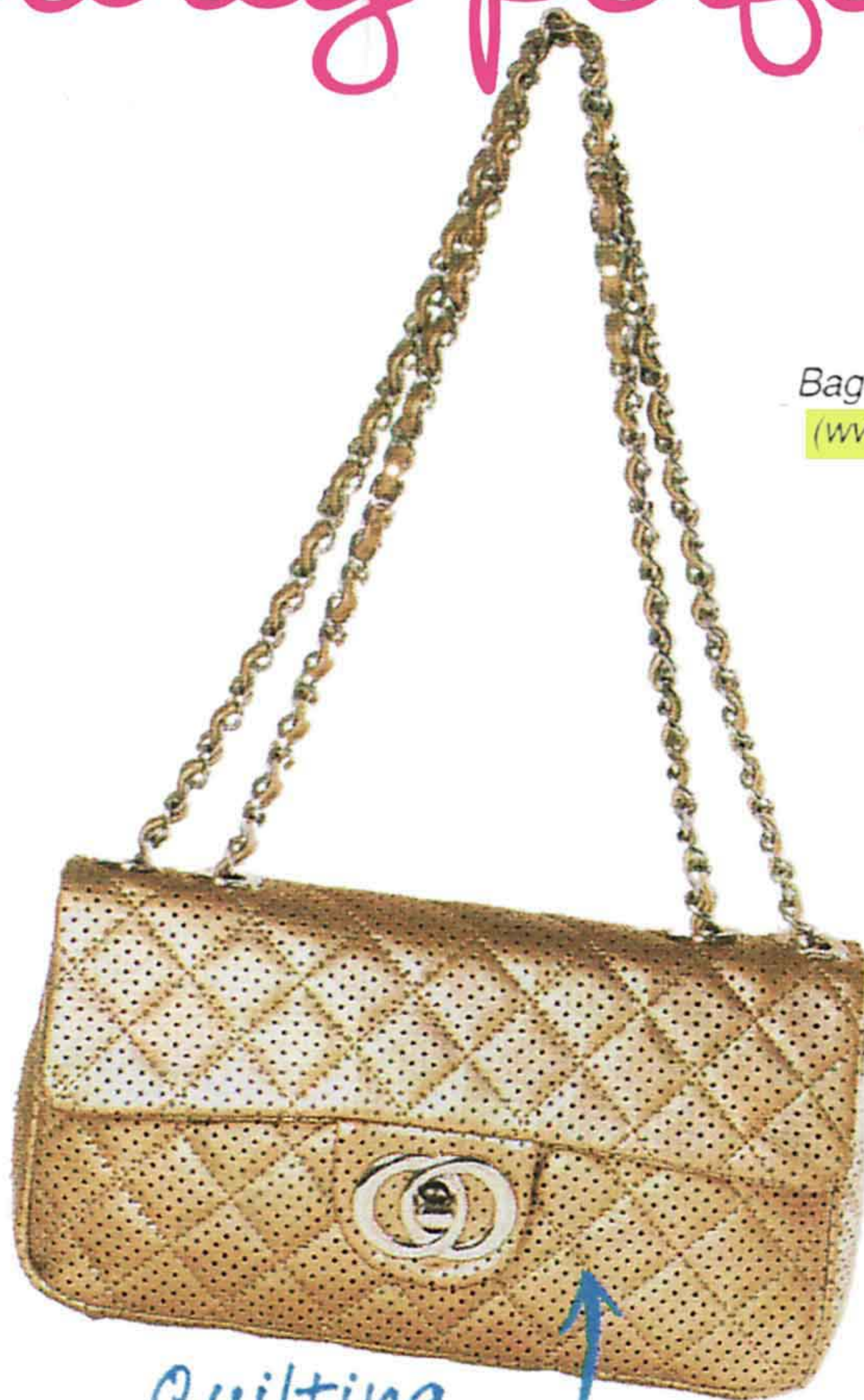
Bag: $34.99, Baghaus. ( www.baghaus.com ).

Quilting and chain-link look just like Chanel!