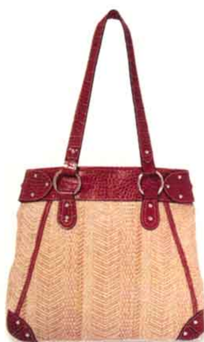
PUT IT IN NEUTRAL The herringbone texture of Rosetti Handbags' tote ($48) spans the seasons