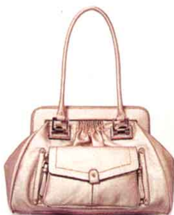
CONTAIN YOURSELF Strike it rich with baghaus.com's posh five-pocket pewter satchel ($56)

These warmer-weather bags are priced so low they'll induce reverse sticker shock