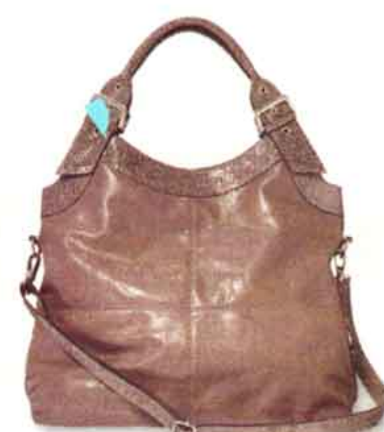
LIVING LARGE Deep and roomy, The Limited's tote ($65) can shoulder any burden