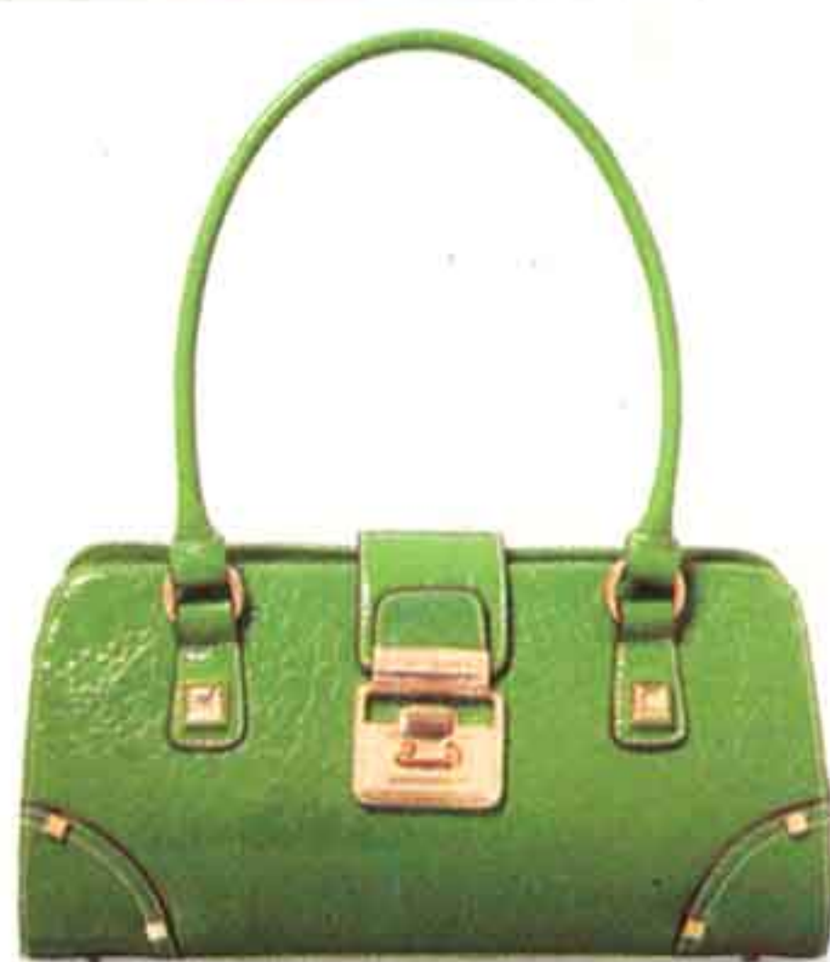
SWEET AND PETITE Green patent leather gives a sassy spin to Linea Rosetti's dainty pocketbook ($45)