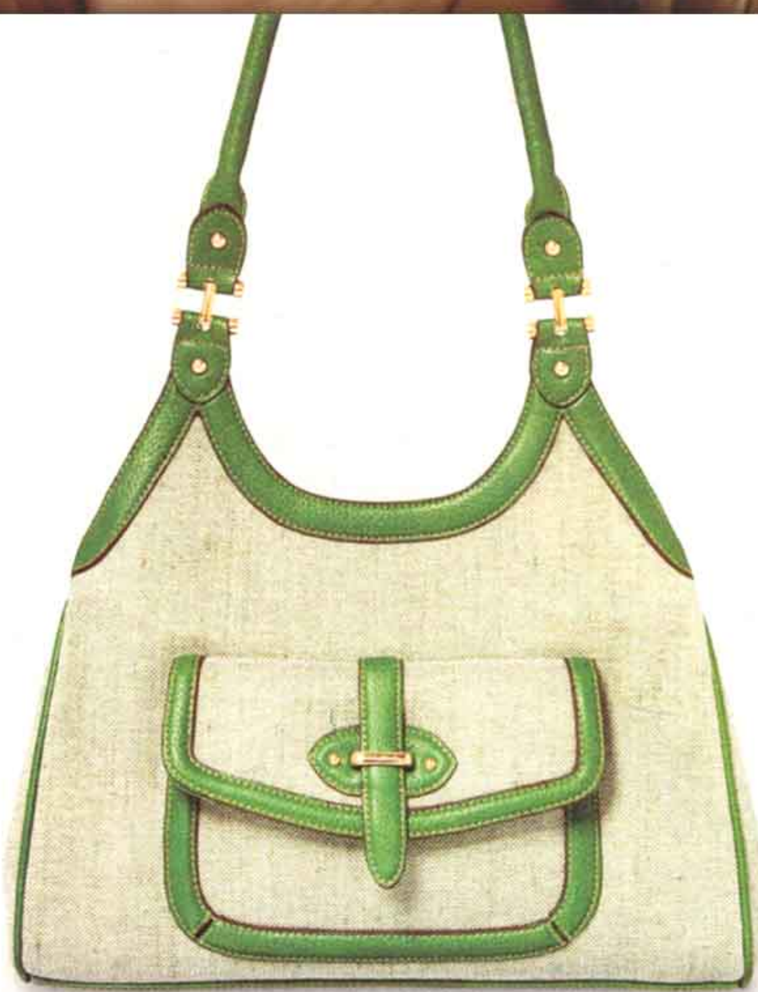
MAKE IT SNAPPY Trimmed in crisp lime and accented with sleek gold hardware, Sears' clean-lined carryall ($42) instantly upgrades any outfit