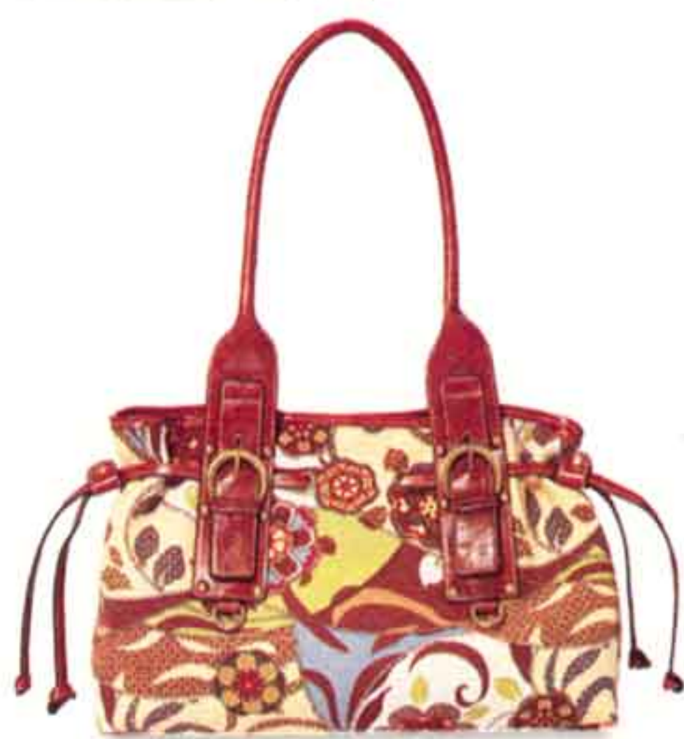
CALMING COLORS The florals are zany but the hues are subdued on Rosetti Handbags' charmer ($48)