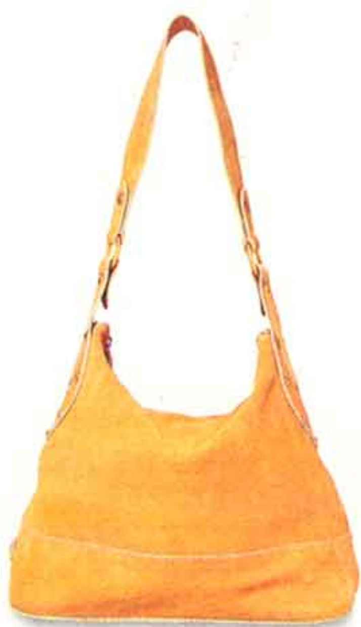
YOU'RE NO SLOUCH A studded, supple suede hobo ($50) by T.J. Maxx looks good and holds a lot