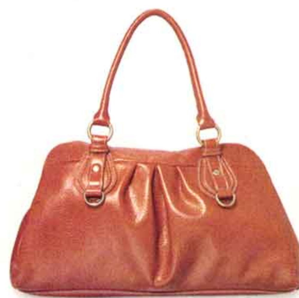
SEND IN THE BROWNS Pared down but not boring, Dolce Vita's purse ($28) has right-now pleating